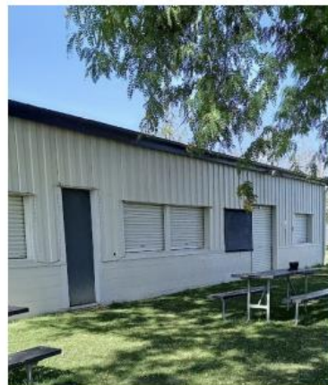
Trivia in the Pavilion at the Kalbar Show and Campground

PLUS there'll be great prizes to win on the night!